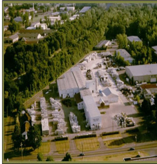
UNITED CONCRETE PRODUCTS, INC.